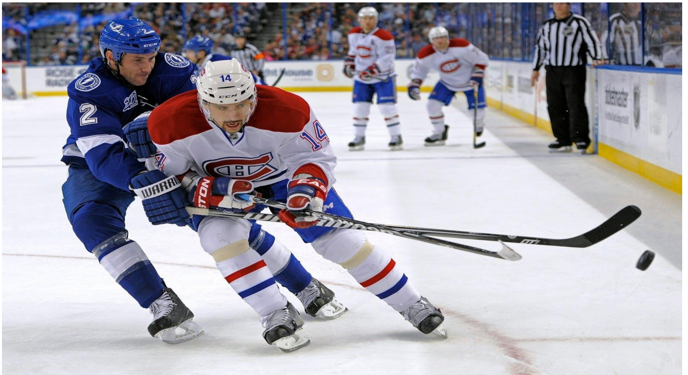
H/P Boys Hockey Championships in Blythe - February 28